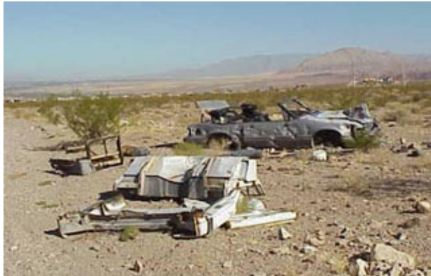
Dumping near the River Mountains Loop Trail— Right here in your neighborhood!

The annual "Make a Difference Day" celebration has inspired millions of citizens across the country to undertake community-based projects and address local problems community by community. But the success of all of these efforts relies on the help of local volunteers like you.